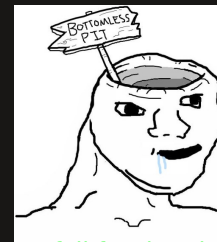
He fell for the glow op

In computing you can 'dual boot' and run two systems on one machine. This kind of illustrates how we preserve the influence of our birth culture, whilst hacking and building something new and adversarial from the ONA kernel.