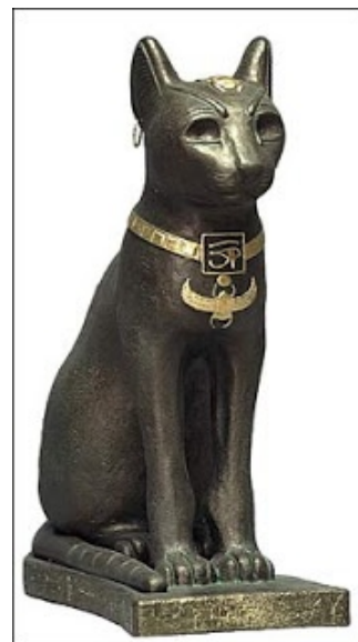
Cat Goddess Bastet